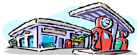
Table 1. National Air Toxic Standards for Gasoline Dispensing Facilities (GDF) (40 CFR 63, Subpart CCCCCC) 1